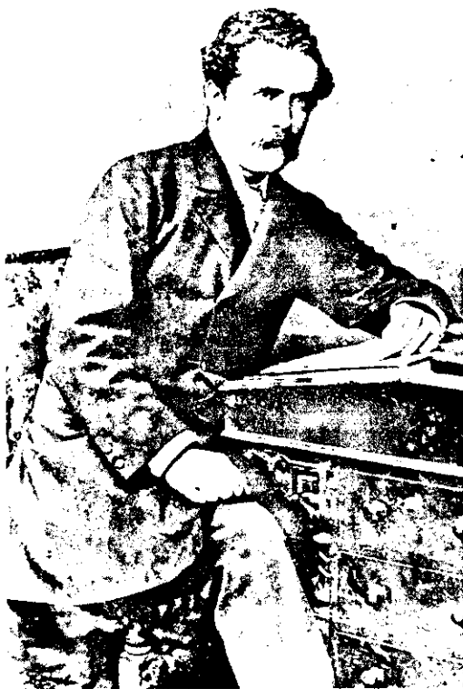
Fig. 1 Archibald E. Garrod in 1899, the year he reported a method to detect homogentisic acid in "black urine disease" (alkaptonuria). (Taken from ref. 4, with permission.)

Northern blot hybridization with EST-77725 revealed strong tissue-specific expression of HGO (mRNA, 1.8 kb) in liver and kidney as expected; but also in prostate where deposits of HGA